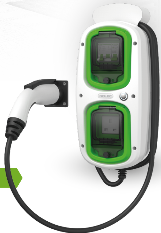
Unit shown: WALLPOD:EV MULTIMODE Tethered Type 1 Charging Unit

This unit also doubles up as an outdoor IP65 rated domestic 13amp maintenance socket ideal for home/garden maintenance.